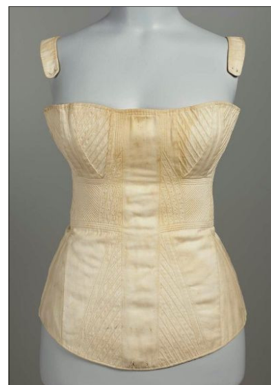
Boston Museum of Fine Arts # 99.664.34 - 1820s