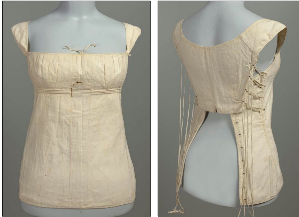
Boston Museum of Fine Arts #49.904 - 1820s or earlier

Most of us are familiar with the parable of the two builders.